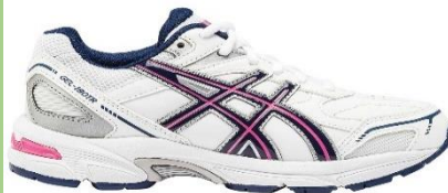
PERFECT – cross trainer